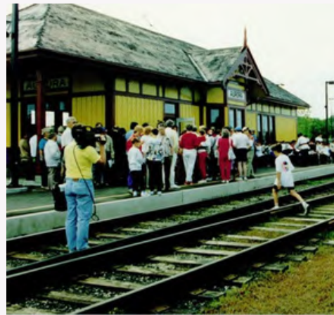
Erection of the provincial plaque at the Aurora Train Station.

times required of our fledgling volunteer group in matters of advocacy, program development, and promotion. How could the AHS best contribute to a new kind of, mid-20th century, cultural modernity, one concerned with the emerging role of historic knowledge, and the contribution of cultural conservation to an increasingly, layered, and complex, mid-20th century, modern world of public affairs?