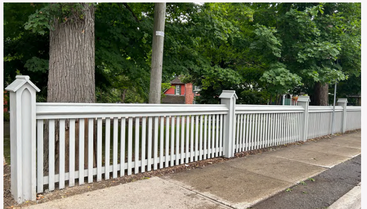
Repaired fence, August 2024.

The AHS contracted local business Hudeck Contracting to complete the necessary repairs. They responded promptly and quickly got to work repairing the three sections affected. We thank them for their professional work and dedication to heritage restoration.