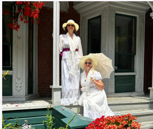
Guests of the AHS Victorian Garden Party all dressed up, enjoying tea and activities on the grounds.