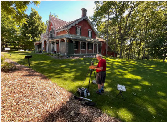
SOYRA artists enjoy the beautiful weather and use Hillary House as inspiration for their latest art pieces at this plein air session.