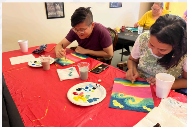
Participants enthusiastically complete their masterpieces at Paint Night, in partnership with Royal Rose Art Gallery & Gifts.