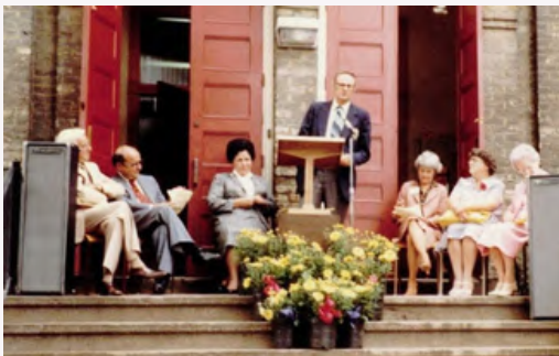
Plaque unveiling at Church St. School.