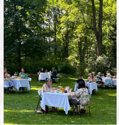
Guests enjoying the weather and afternoon tea at the Victorian Harvest Tea.