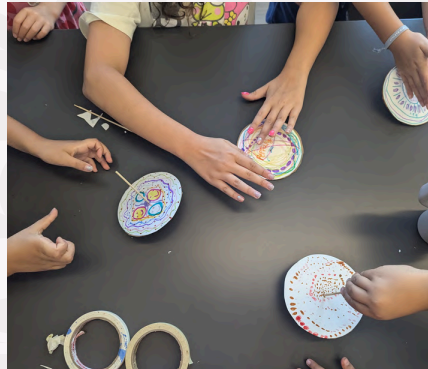
Summer months for the AHS have been preoccupied with providing engaging programming for many local campers.