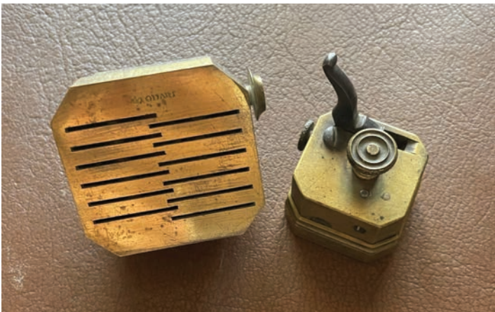
Victorian Scarificator on display at Hillary House