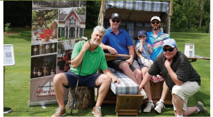
Golfers enjoying the green while supporting Hillary House at the AHS Golf Tournament. Thank you to all of the sponsors, golfers, and volunteers who made the day successful.