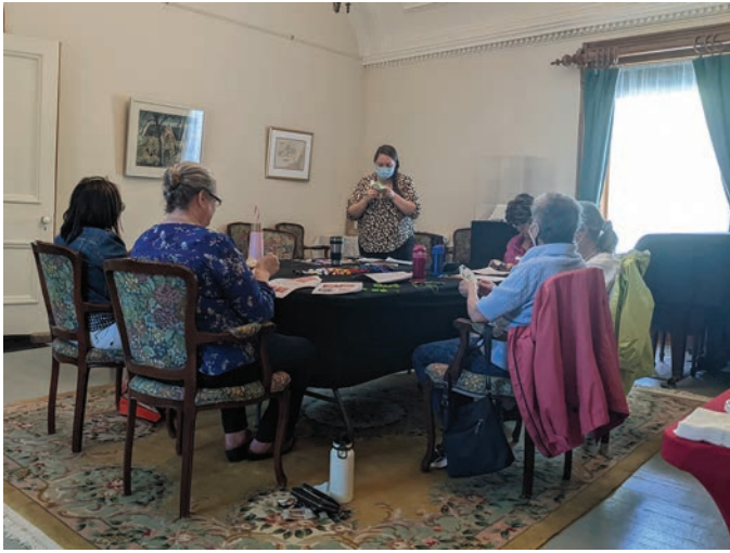
Participants at the Beginners Hand Embroidery Workshop learn the basics of the craft.