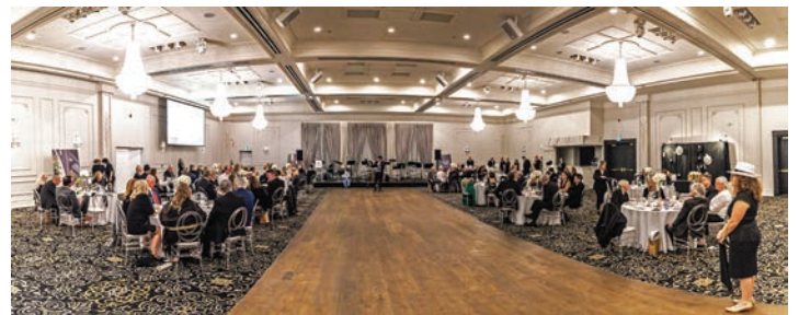
A captivated Hillary House Ball audience at the Royal Venetian Mansion.