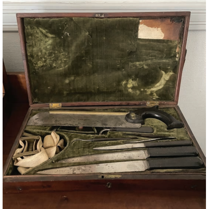
Amputation Kit on display at Hillary House

The major theory during the Victorian Era was the 'Miasma Theory,' a now-defunct understanding that disease and illness were caused by decay and rot (miasmata) emanating into the air, and then causing disease through exposure. Take for example the scarificator. The device was placed on the body and the top lever was pulled, which slashed blades across the skin to induce bleeding. It was used to draw blood out of a sick person in hopes of healing them. A modern audience would not understand the reasoning behind this practice, but to the Victorian mind, this method was completely reasonable. The underlying theory of medicine at the time, prevailing since antiquity, was that the body could only heal itself if the poisons, waste matter, and noxious substances of disease, could be quickly drawn away. It was a system based on Galen's (129 CE-216 CE) humoral system of health. The ancient Greek father of Western medicine reasoned that if all four elements -- yellow bile, black bile, phlegm, and blood -- were balanced, then you were in good health.