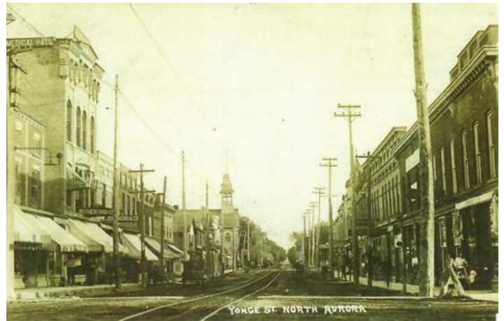
This 1909 image shows Yonge Street looking South from Wellington Street.

5 Hillary House is designated a National Historic Site because it's one of the best examples of what type of architecture?