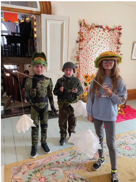
Attendees at A Haunted Halloween at Hillary House enjoy the festivities.