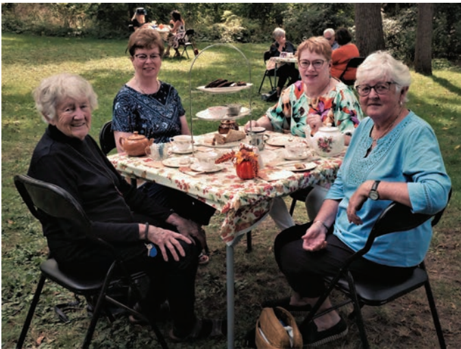
The weather was beautiful for the 3rd Annual Victorian Harvest Tea in September. Guests enjoyed a delicious meal prepared by the Aurora Legion Ladies Auxiliary and Hurst Bakery. Thank you to the volunteers who helped make the event a great success.