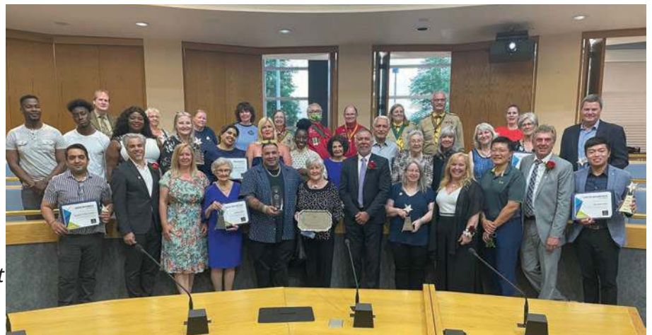
Town of Aurora Recognition Award Winners.