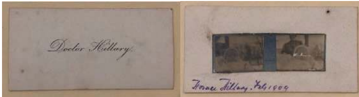
Photos of baby Holly Hillary glued to a Doctor Hillary calling card.

By the early 1900s, Kodak launched its infamous Brownie camera. Some consider it to be the most important camera ever made, mainly due to its affordability and accessibility. It was produced so cheaply that anyone, not just professionals or the wealthy, could own one and be able to use it with ease. As a result of this increase in access to photography, there was a shift away from the more formal posed photos of the past, with photos becoming more in the moment and candid.